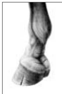
Quarter cracks and cracked heels come from hoofs too dry and hard to absorb shock.