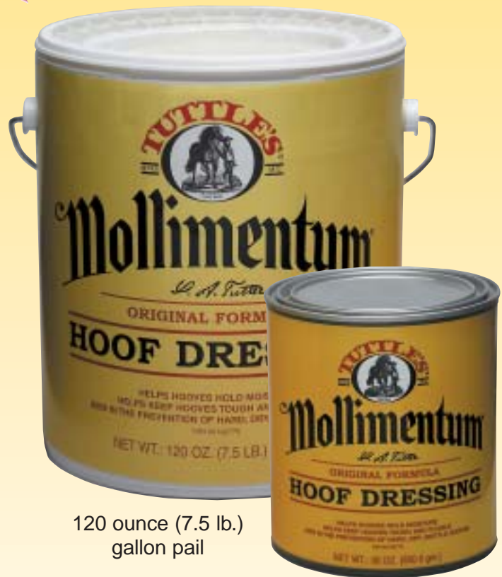
120 ounce (7.5 lb.) gallon pail