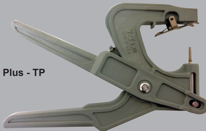
Ultra Tagger Plus - TP

USDA Animal Disease Traceability (ADT) requires the following cattle and bison be identified for interstate movement in order to satisfy the rule for ADT: